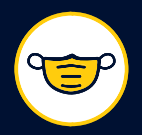
Wear it when you go out