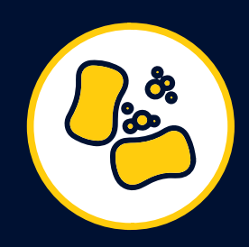
Wash it every 2 days